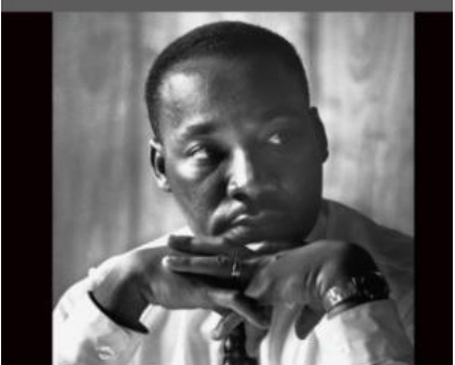
and His (Unfinished) Therapy With the Soul of America